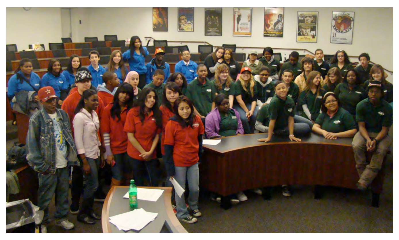
Members of the Center's youth courts at a Law Day celebration at New York Law School in April.