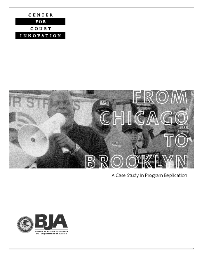
From Chicago to Brooklyn charts how Save Our Streets adapted a Chicago anti-gun-violence program to the Crown Heights neighborhood of Brooklyn.