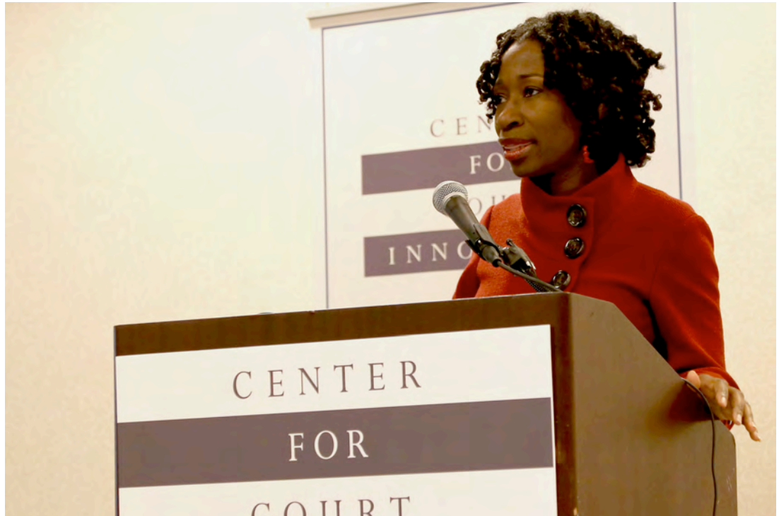
Victoria Pratt, chief judge of the Newark, N.J., Municipal Court, spoke about procedural justice at Community Justice 2016.