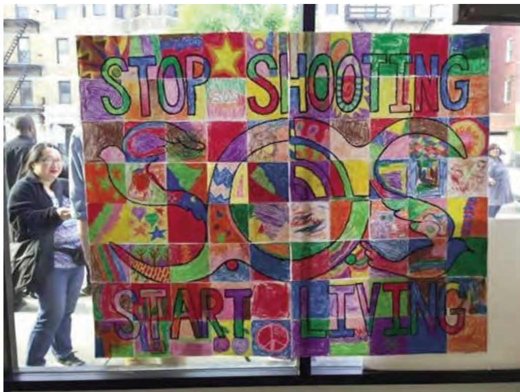
The Crown Heights Community Mediation Center hosted the “Arts Against Violence” exhibit.

equivalent caseload per defense attorney in Brooklyn decreased from 505 to 358, representing a 29 percent reduction in workload.