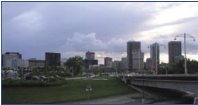
Downtown Skyline, Winnipeg

Mackintosh thinks the program can help solidify gains already achieved by other safety initiatives. "We've been making a lot of efforts to strengthen the downtown area and we certainly don't want those efforts to be undermined by the perception that it's an unsafe place to be."