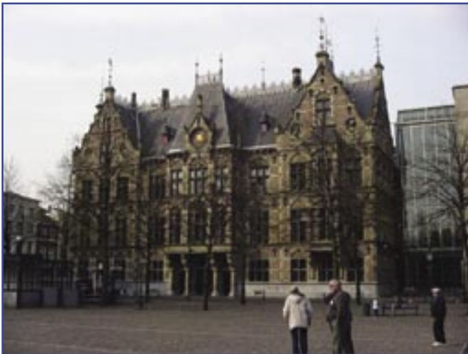
Department of Justice, The Hague

Jibs are supposed to deal with individual cases and set specific, measurable goals (like the percentage of juveniles sentenced to probation and the number of alternative sanctions imposed). The decision to start a Jib must be made in consultation with the mayor, chief public prosecutor, the chief of police and the Local Criminal Justice Board (made up of the heads of all the local justice organizations), Boersma wrote.