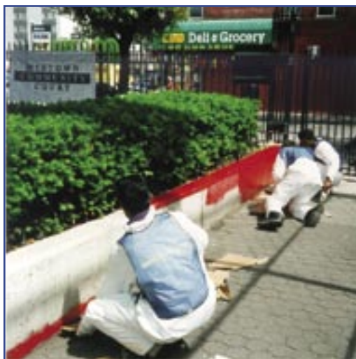
Offenders at the Midtown Community Court are mandated to "pay back" the neighborhood for their offending by repairing conditions of disorder. Here offenders help paint a wall in a park.

across international boundaries. This paper does that by offering a comparative look at countries outside the U.S. that are actively exploring community courts and community prosecution. The countries surveyed are South Africa and England, which have established community courts; Sweden, the Netherlands and Manitoba, which have launched community prosecution programs; and Australia, British Columbia, and Scotland, whose work in these areas is still in the planning stages.