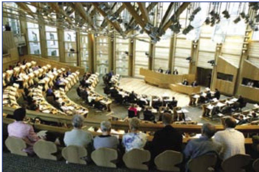
The debating chamber at the Scottish Parliament in Edinburgh