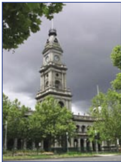
Town Hall in Collingwood, Melbourne

As a three-year pilot, the center will be subjected to rigorous evaluation to measure results. Such was the case with the early Koori courts and the pilot drug court, which had sunset provisions in their enabling legislation until an evaluation established their effectiveness.