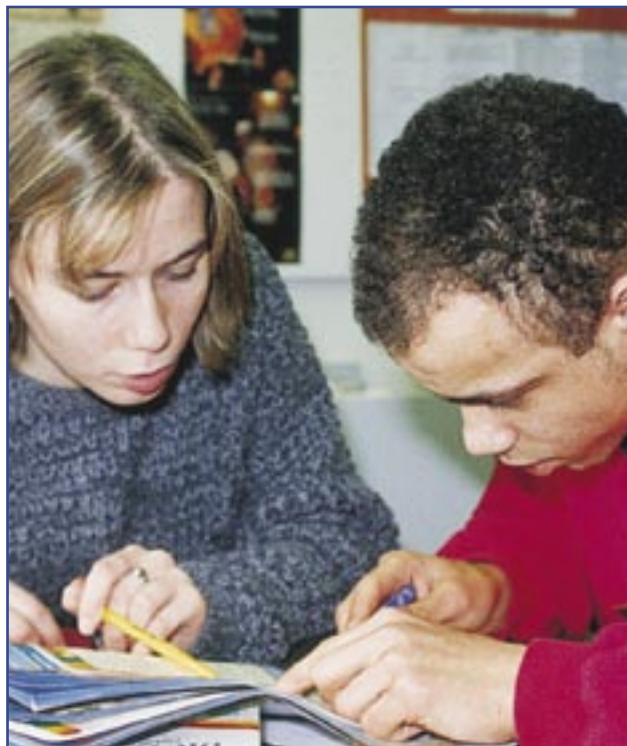
The recruitment campaign for a new mentoring scheme launched by the Community Justice Centre, North Liverpool, has proved a huge success with all volunteer places filled for the first phase.

According to a spokesman for the Home Office quoted in The Independent Review , "Liverpool has suffered and is still suffering from economic deprivation and from the effects of anti-social behaviour and low-level crime in some of its