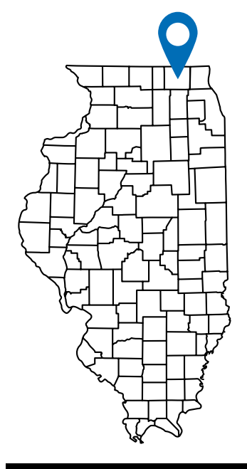
McHenry County Specialty Courts Woodstock, Illinois

McHenry County is a rural area located 63 miles outside of Chicago. The county currently has two problem-solving courts: an adult drug court and a mental health court. These courts, however, grapple with a shortage of residential treatment resources in the community. Participants who need residential treatment typically must utilize far-away facilities,