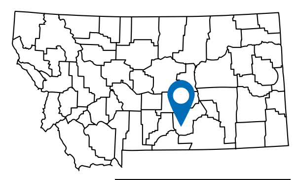
Yellowstone County Veterans Court Billings, Montana

Montana has one of the largest veteran populations in the United States. But the state also has one of the lowest population densities in the country, so these veterans tend to be spread across great distances and often are not within reach of needed services. This geographic isolation poses a challenge to the Yellowstone County Veterans Court—also known as CAMO (Court Assisting Military Officers)—which is one of only three veterans treatment courts in Montana. CAMO sought to use technology to reach more justice-involved veterans who live in isolated parts of the state.