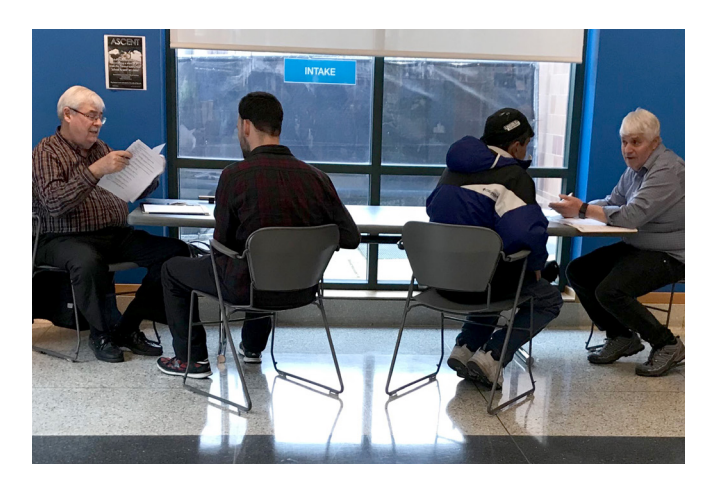
Trained community volunteers (far left and far right) explain the court process to potential participants.

The program defined its purpose and mission as follows: The Downtown Community Court of the City of Spokane seeks to reduce and properly address quality of life