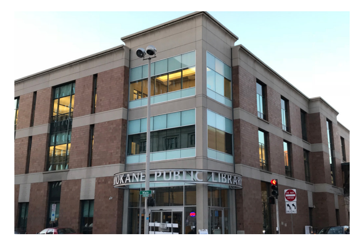
Street view of Spokane Public Library's downtown branch, which hosts weekly community court sessions.

In 2010, stakeholders from the City of Spokane, Washington, began a planning process to respond in a new way to an increase in lower-level offending. They worked with the Center for Court Innovation to pioneer a model that locates a community court within a library, expanding the options that courts have to partner with the communities to best serve them in strategic ways. That model met several needs and has achieved a number of key goals. Over a dozen jurisdictions have either opened or are in the process of planning replications. This case study outlines how stakeholders in Spokane planned and implemented their community court to meet the city's unique needs. It highlights the opportunities and challenges that come with operating a program in a new context with new partners.