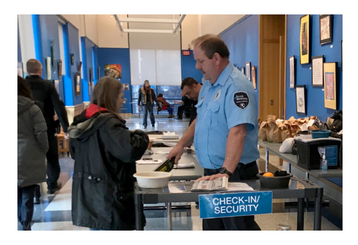
Court security check in participants and offer secure storage for those carrying personal belongings.

Providing security. Planners needed to balance the court's typical security concerns with the public interest in providing regular access to the library. The court hired a security company that set up an officer at a screening table at the entrance of the library section where court is held. The security officer, who is present only on court days, uses a handheld magnetometer to screen people entering the court space, and issues security cards to court participants for bathroom access. For court participants experiencing homelessness or housing insecurity who travel to court with many belongings, court security offers a safe space for items to be secured while participants are meeting with the court team and providers.