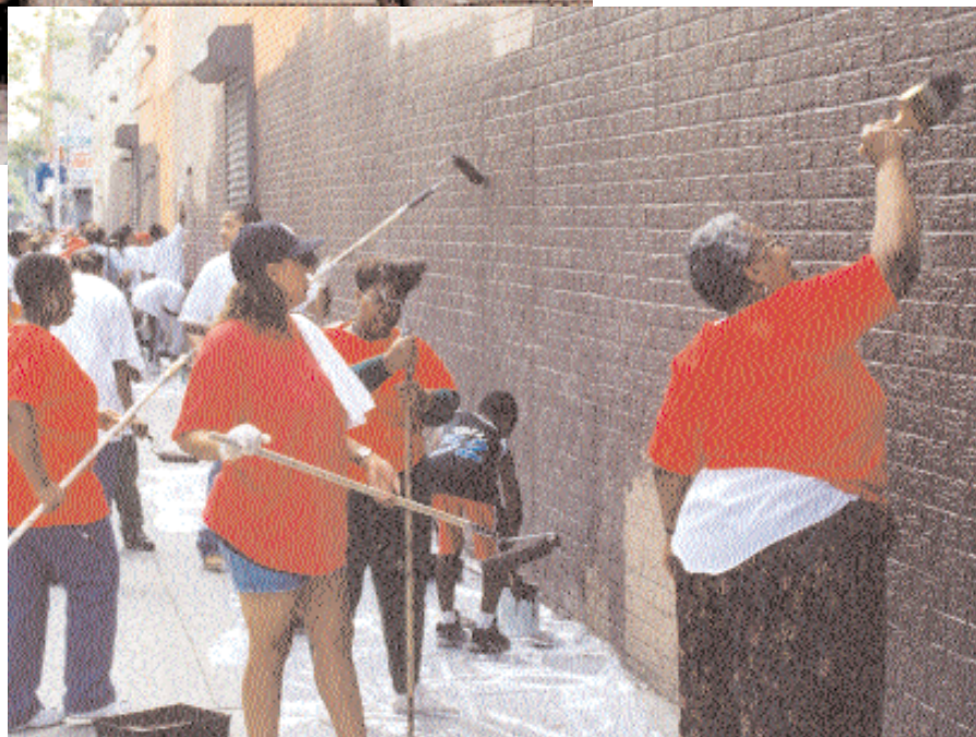
CENTER FOR COURT INNOVATION

court in the first place; it achieves this end by providing the judge with a wide range of sentencing options that can be tailored to individual defendants. Viewed through this lens, a Community Justice Center is a gateway that links people to needed services (such as drug treatment, job training, and adult education) and leverages the authority of the judge to make sure that defendants comply. According to British Home Secretary David Blunkett who is responsible for criminal justice policy for England and Wales: