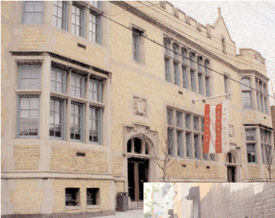
CENTER FOR COURT INNOVATION

Below, Red Hook Public Safety Corps community volunteers paint over a wall of graffiti.