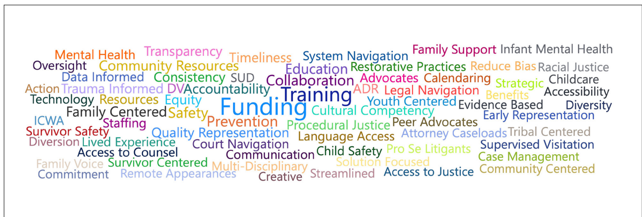
Word cloud from coded interactive poll question: What do you think the goals or areas of focus for this initiative should be?

After all the working groups have made their recommendations at the conclusion of the strategic planning process, the Center will develop a final vision statement for the Family Justice Initiative, as well as a set of goals to support that vision, to be included in the final report and recommendations.