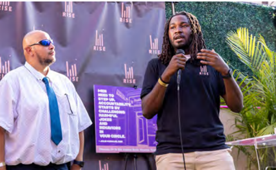
RISE staff announce Men Rising in the Bronx, where survivors, advocates, and local leaders joined us to break down silos in anti-violence work.

Gun violence and gender-based violence are intertwined, but efforts to address them too often operate in silos. Our new Men Rising Initiative bridges that gap, mobilizing men in anti-gun violence programs to prevent gender-based violence. The program builds on our years of work developing community-driven responses to gun violence and intimate partner violence across New York City.