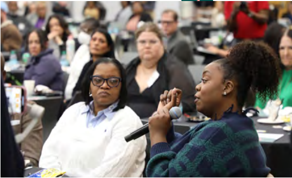
Top: Artists created six pieces of art, with partner Artistic Noise, to welcome people to our Midtown courtroom; Bottom left: Our Queens Community Justice Center youth and staff pose at job fair; Bottom right: An attendee of our national conference shares insights on the future of municipal courts at Rutgers University.