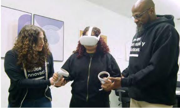
Our Newark team’s Virtual Reality Adventure Therapy proposal offers an immersive, more accessible alternative to traditional therapies.

Our staff has always been at the forefront of our mission to build innovative solutions to local challenges. That’s why we invited our staff who work with community members every day to pitch their own ideas to meet the needs of the communities they serve. In the first year of our Innovation Fund, we invested $25,000 and $225,000 in seed funding for two ideas with the potential to spark system change—Virtual Reality therapy to increase access to support for young people dealing with trauma, and an eviction relief initiative for tenants with repair needs that will inform housing policies nationwide.